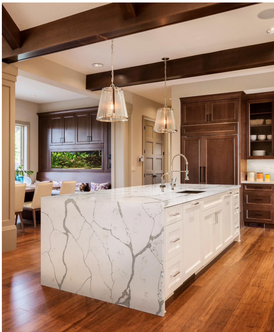
Zodiaq® Calacatta Natura residential kitchen installation

Functional unit is 1 m 2 (10.8 ft 2 ) of product for a period of 10 years in use.