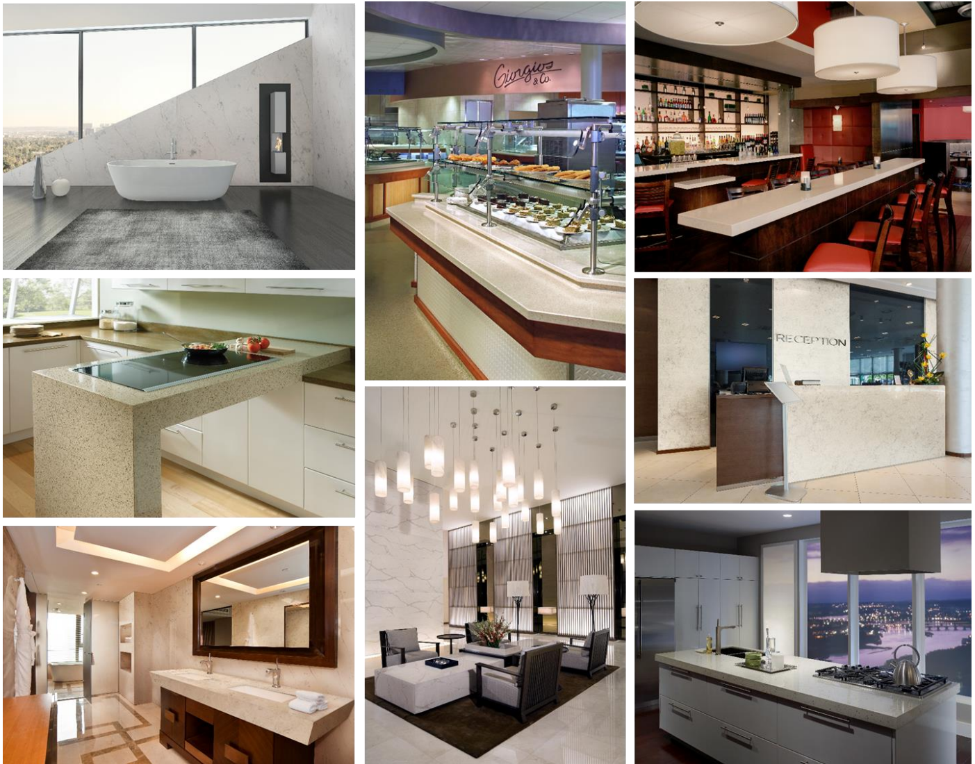
Figure 1: Photographs of Zodiaq® quartz in its various applications